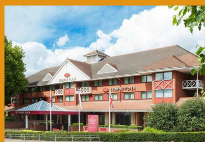
Crown Plaza Hotel, Reading

Essex Fire Protection expertly undertook fire-stopping installation for all service penetrations breaching compartment floors and walls. Our solutions are meticulously designed to achieve the required 60-minute fire rating.