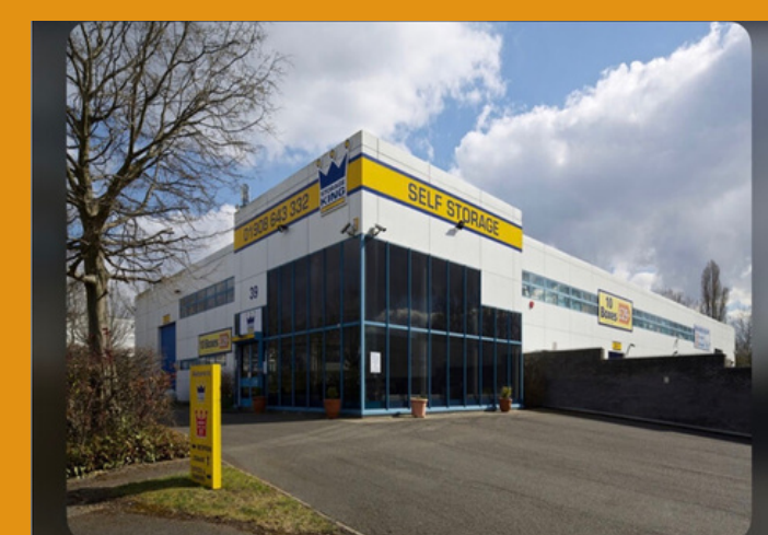
Storage King, Milton Keynes

Essex Fire Protection executed meticulous fire-stopping installation for all new service penetrations resulting from the installation of new air conditioning units at the hotel. This project spanned an extensive 10 phases.