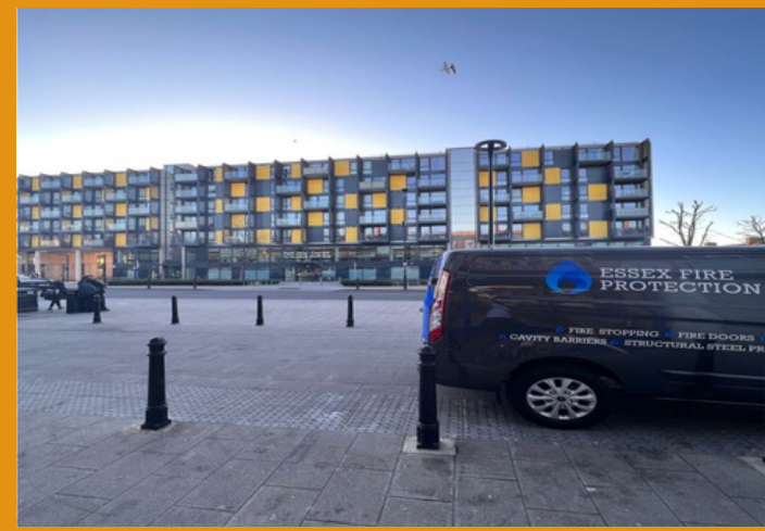
Parkview Centre, London

At Essex Fire Protection, we delivered expert fire-stopping services for new air conditioning and ducting systems that penetrated compartment floors and walls.