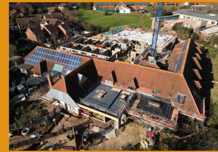
Martlets Hospice, Hove

At Essex Fire Protection, we delivered expert fire-stopping services for new air conditioning and ducting systems that penetrated compartment floors and walls.